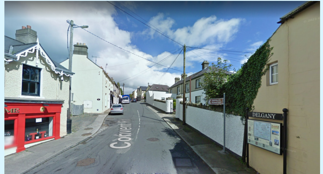
Figure 2 - Existing Road Layout L-1027